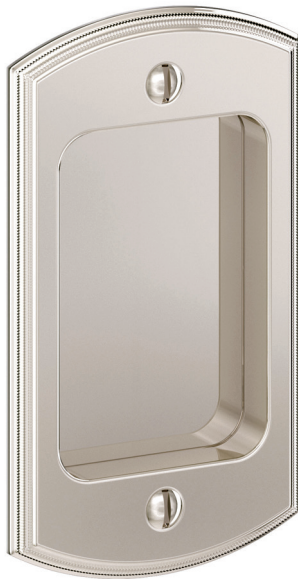
216C67 Passage Flush Pull