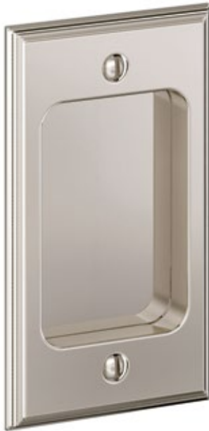
216C47 Passage Flush Pull