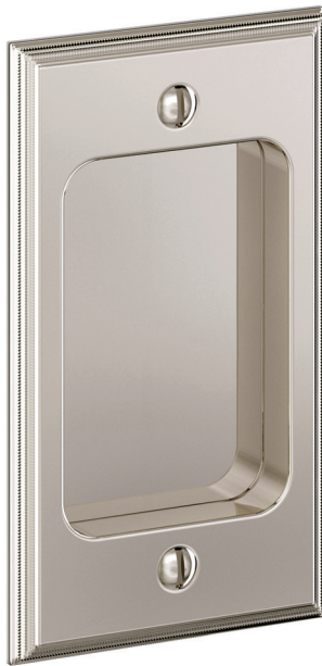
216C47 Passage Flush Pull