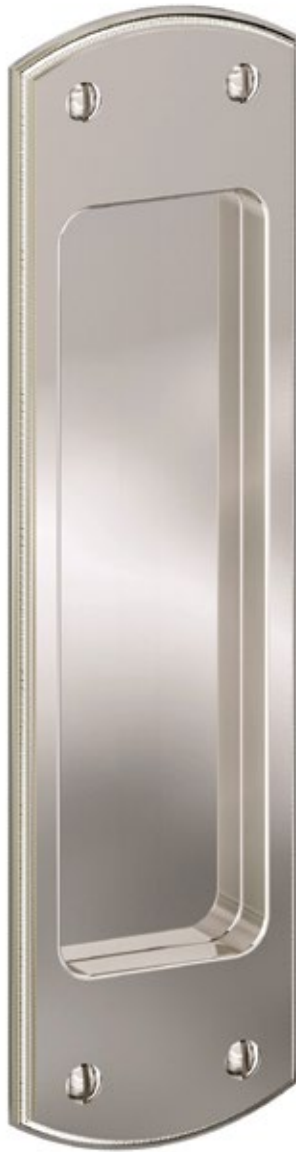
216C11 Passage Flush Pull