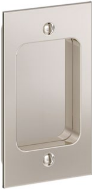
21547 Passage Flush Pull