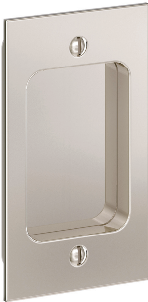
21547 Passage Flush Pull