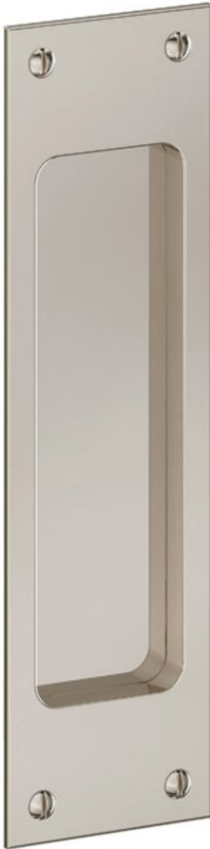
21510 Passage Flush Pull