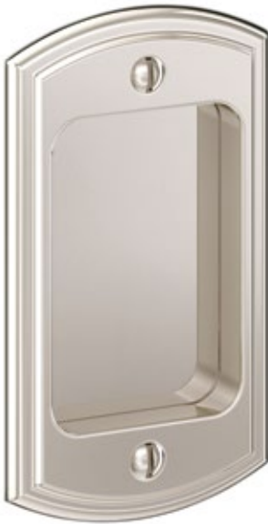
21467 Passage Flush Pull