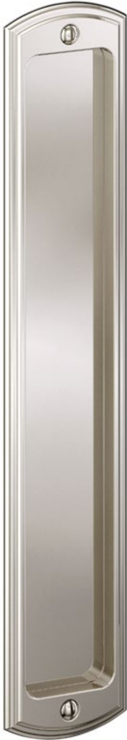
21466 Passage Flush Pull