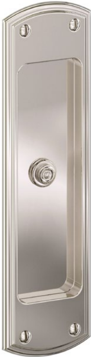
21430 Privacy Flush Pull - Exterior