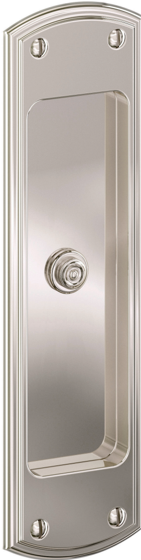
21430 Privacy Flush Pull - Exterior