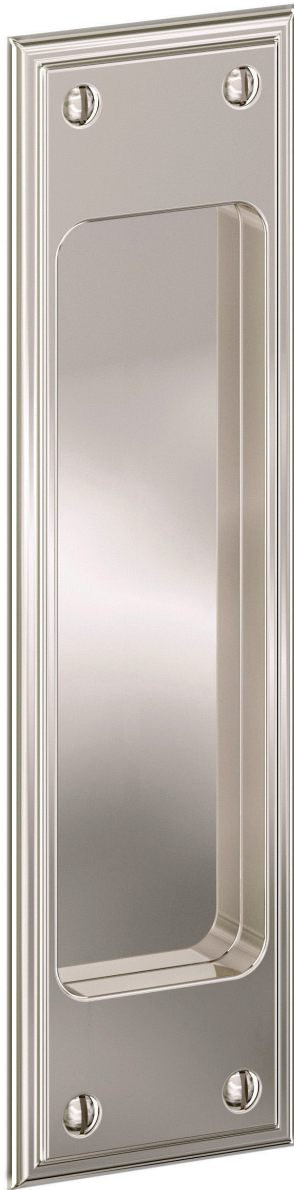
21410 Passage Flush Pull