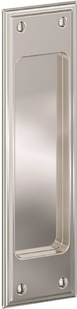
21410 Passage Flush Pull