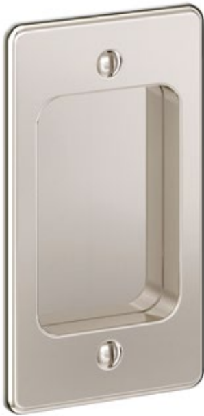
21347 Passage Flush Pull