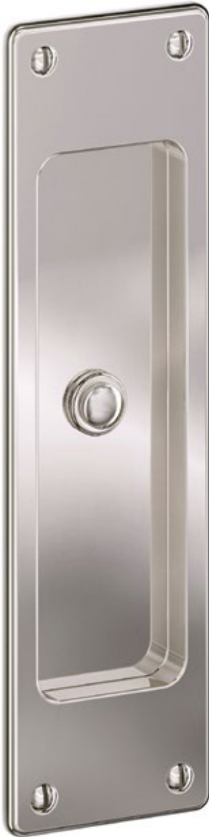
21310 Privacy Flush Pull - Exterior