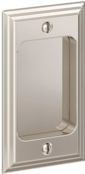
21247 Passage Flush Pull