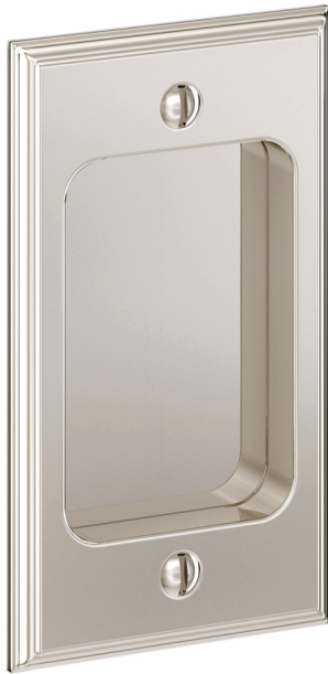
21147 Passage Flush Pull