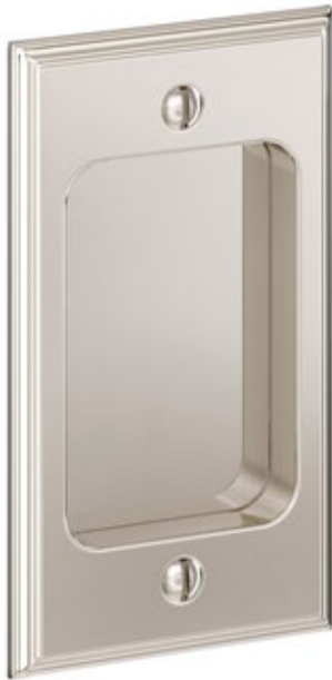
21147 Passage Flush Pull