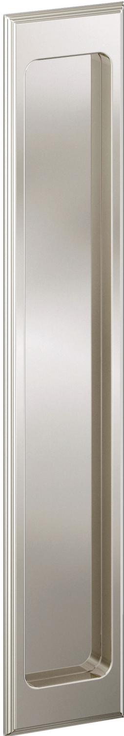
21146 Passage Flush Pull