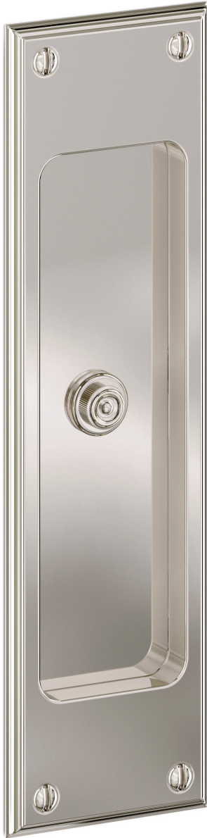
21110 Privacy Flush Pull - Exterior