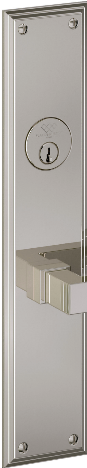
21201 Escutcheon 23040 Lever