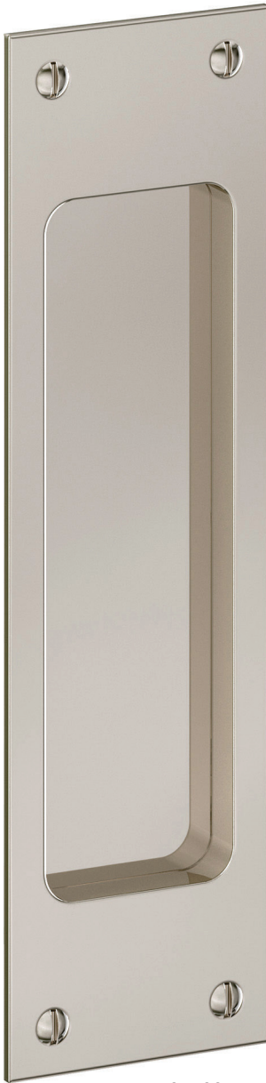
21522 Passage Flush Pull