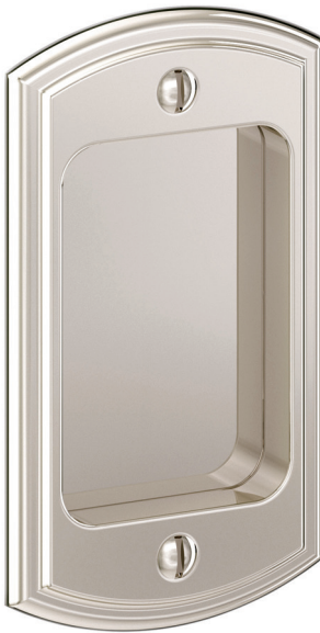
21467 Passage Flush Pull