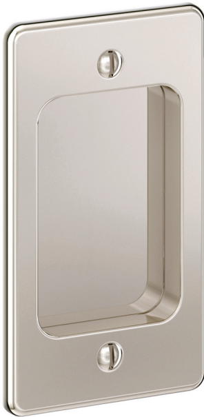
21347 Passage Flush Pull