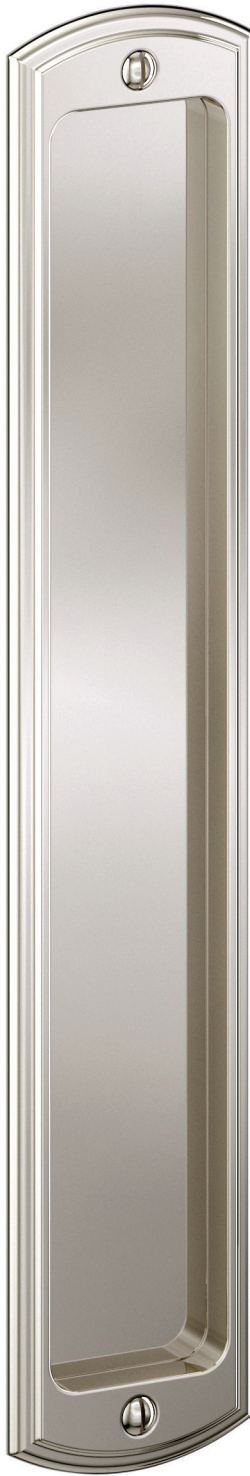
21466 Passage Flush Pull