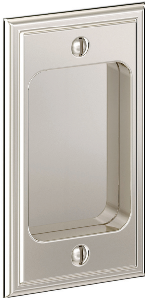
21447 Passage Flush Pull